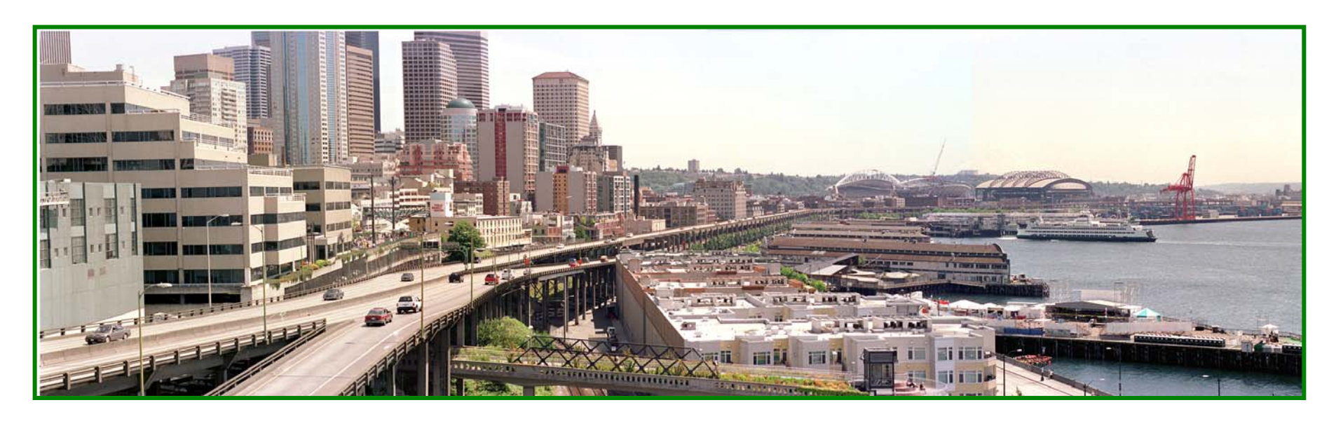
Permitting the AWV/SRP Project February 2007